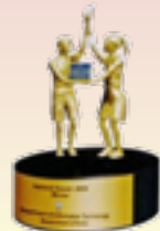
3 rd Computer Literacy Excellence Award

Active and Enjoyable Excellence and Equality Focus on Values Strong Academics Stimulating Environment