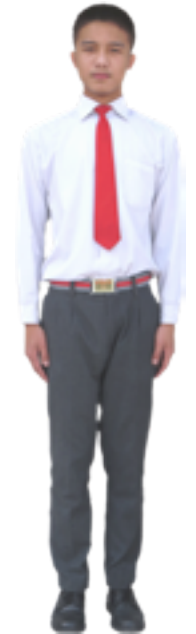
High School Boy Without Sweater