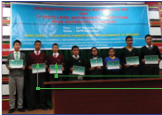
7 th State Level Mathematics Competition Prize Winners