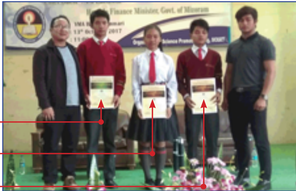
41 st Cash Award for Proficiency in Science and Mathematics