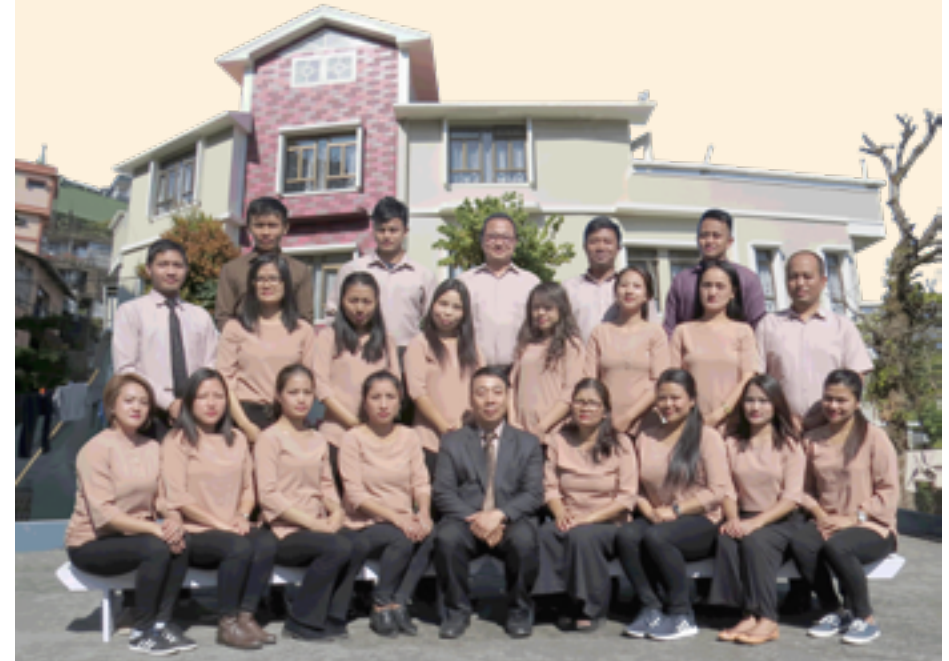
TEACHERS & PRINCIPAL, AR-ELLS SCHOOL-2019

Our dedicated teachers who has passion for teaching and guiding students, desire to learn, resilience, faith and confidence in themselves.