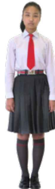
High School Girl Without Sweater